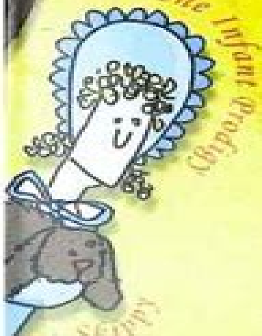
The Infant Profits (Chipper)