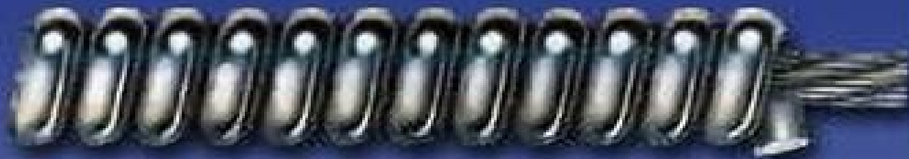
Wire Rope Center Construction