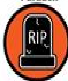
Temporal Afterlife Paradox