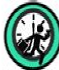
Novikov Self Consistency