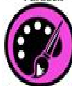
Temporal Artistic Influence Paradox