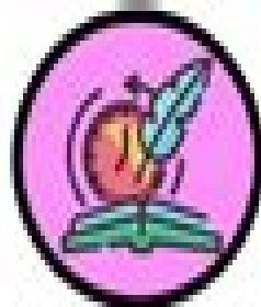
The Bootstrap Paradox