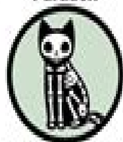
Schrodinger's Time Traveler Paradox