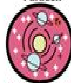
Temporal Species Evolution Paradox