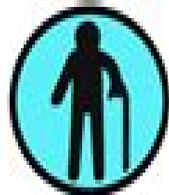
The Grandfather Paradox