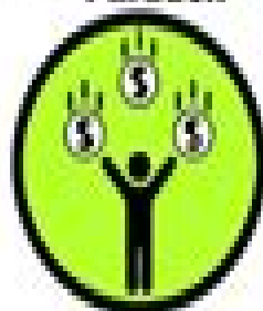
Temporal Lottery Paradox