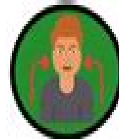
Meeting Yourself Paradox