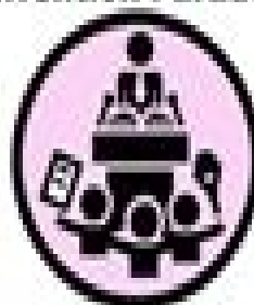
Temporal Democracy Paradox