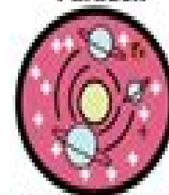
Temporal Species Evolution Paradox