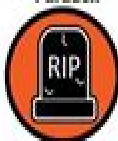
Temporal Afterlife Paradox