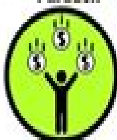
Temporal Lottery Paradox