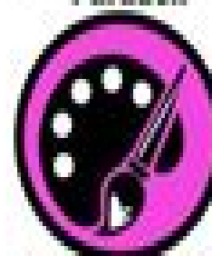
Temporal Artistic Influence Paradox