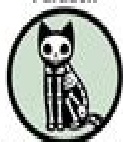
Schrodinger's Time Traveler Paradox